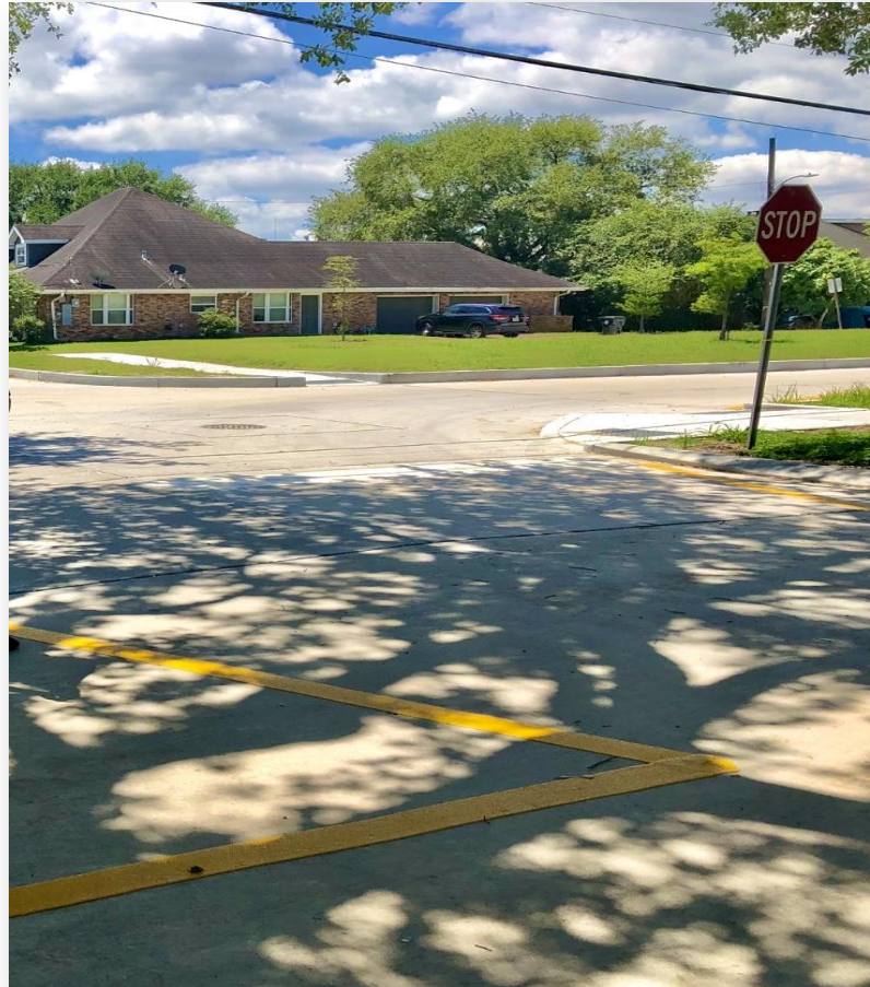
An example of a repaved block on the recently completed Filmore North Group A project.