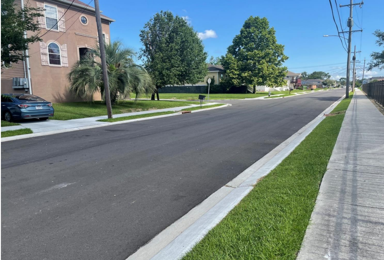
An example of a reconstructed street: 5700 Block of Mandeville Street in the Milneburg Group B Project.