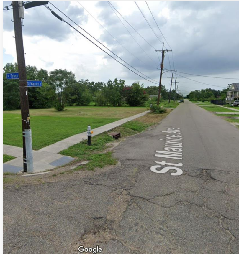
Existing conditions at the intersection of St. Maurice Ave. and N. Prieur St.