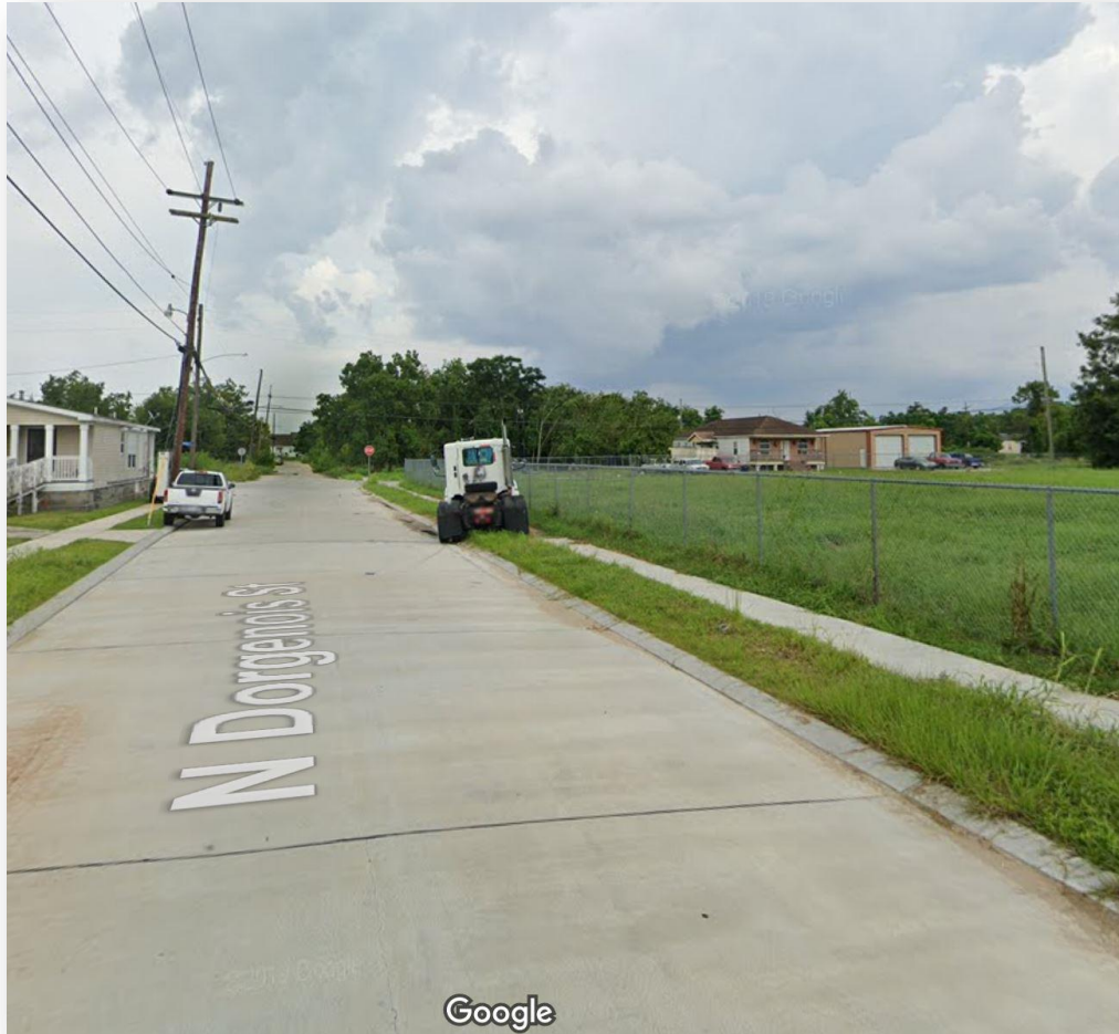
An example of a repaved area of N. Dorgenois St. from the recently completed Lower Ninth Ward Northeast Group A Project.